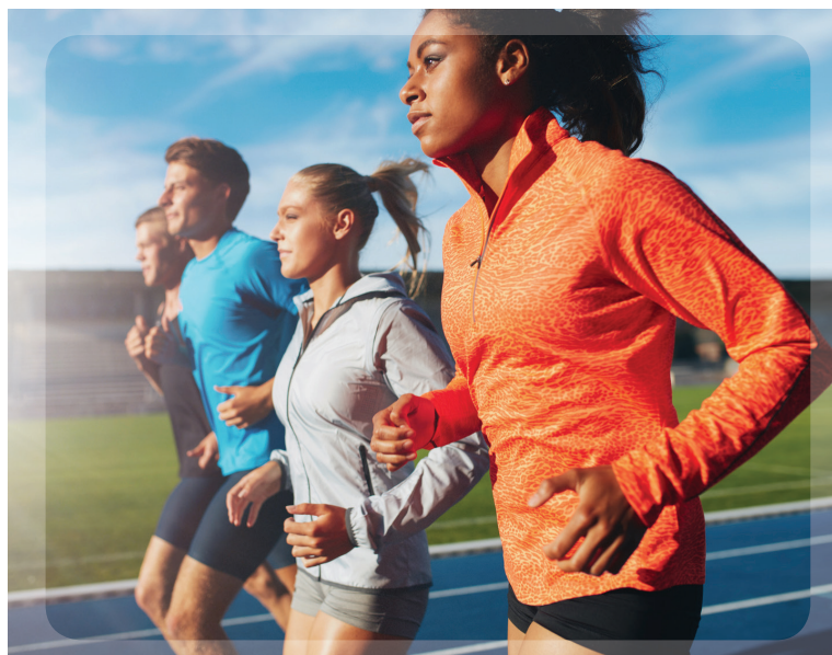
Eradicating gender stereotypes is crucial to strengthening gender equality in sports and decision-making

EIGE's research has identified that measuring the extent of change in decision-making in sports is hampered by the absence of suitable indicators